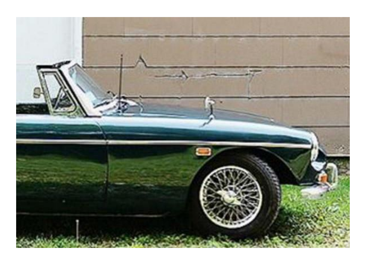
At EBTH, we sell it all...

Furniture, home decor, jewelry, artwork, sports memorabilia, tableware, garden hoses — virtually EVERY item in your home.